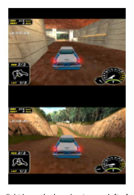
Radar #3: minimum speed: 215 mph

When in the tunnel, try not to pass through the light beam by keeping to your left. As soon as you see the exit, floor it!